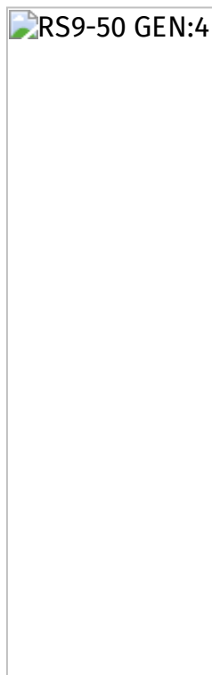
Load Chart imperial